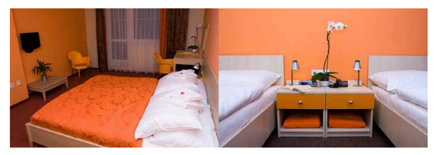
Category 2: Person: 90 EUR / night Single room: 100 EUR