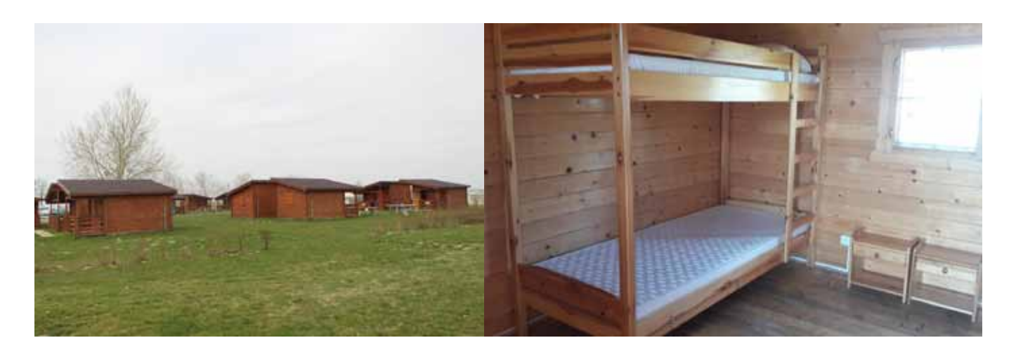
Category 3: Multiple room: 75 EUR / person Double / Single room: 85 EUR / night