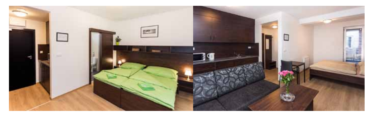
Category 1: Double room: 110 EUR / person Single room: 140 EUR / night

Double room: 130 EUR / person Single room: 150 EUR / night